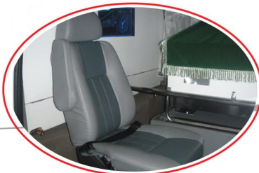
1. Comfort Seat